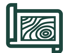
Figure out whether excavation and ground preparation will be included in the job. We always provide a suggested drawing of the building foundation, but we can also carry out the necessary excavation to lay the foundation if desired.