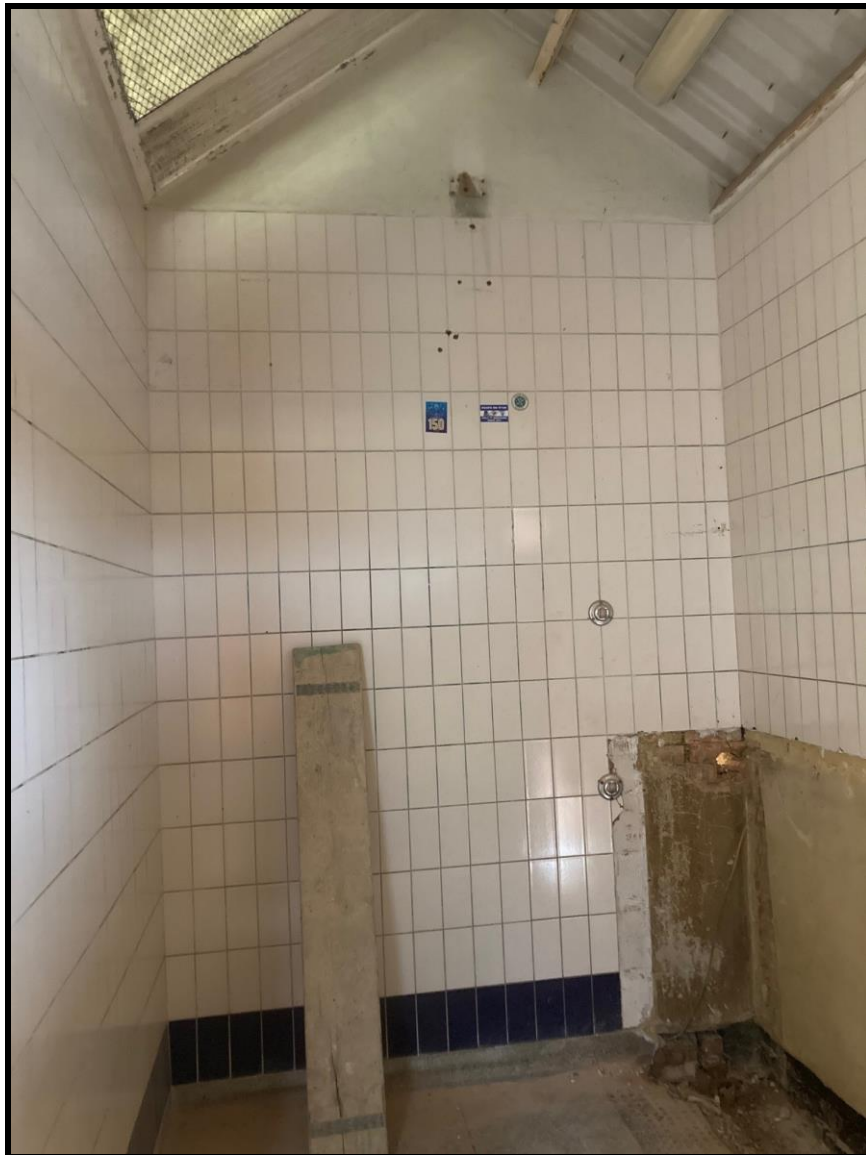
Photo of room at start of a recent ‘Space to Change’ project Henley-on-Thames, Oxfordshire

‘Space to change’ facilities can also be created within an existing building where 12m 2 rooms are not feasible due to space restrictions. These bridge the gap between a fully operating Changing Places facility and a standard Document M DDA compliant facility. The equipment of a Changing Places facility is installed within a 3m x 2.5m space to allow off the floor personal care.